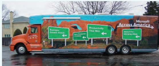
Video and audio systems we installed in seven traveling demo centers for Microsoft.

Cover and inside: photos from Microsoft Vista and Office 2007 introductions we staged in 59 cities. Inside flap: video billboard we installed in Times Square.