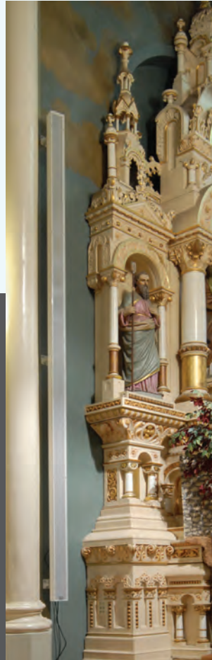
Above: steerable line array installed at St. Michael in Old Town, Chicago.

Specialists in AV systems for difficult environments