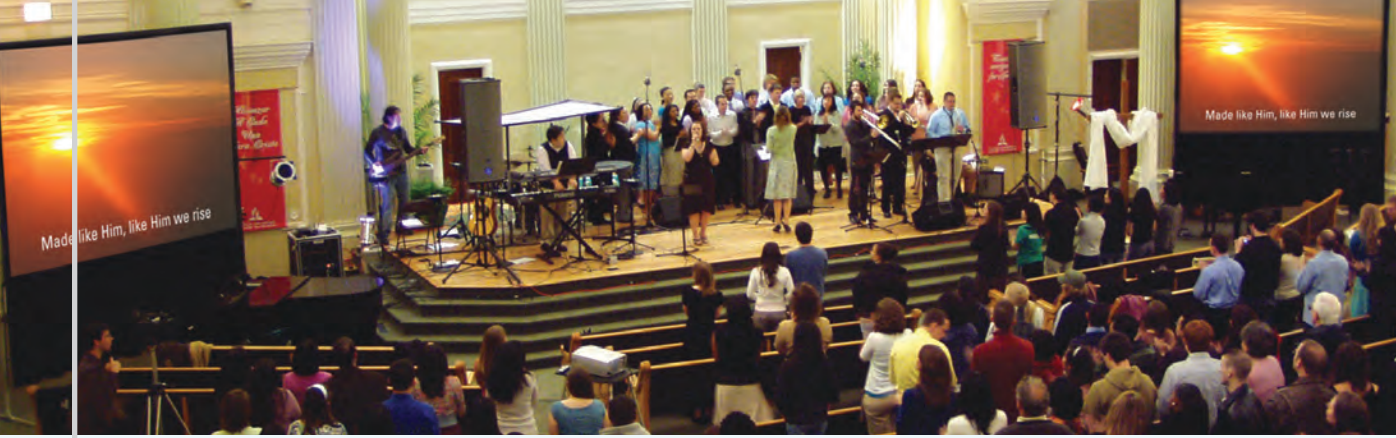
At left: video and audio provided on a rental basis for New Community Covenant Church, Chicago.